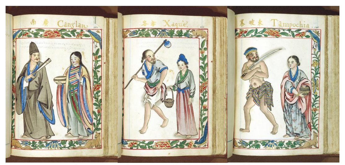
Fig. 5 Boxer Codex