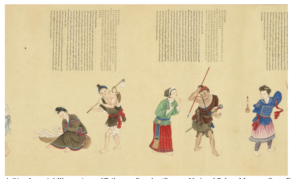
Fig. 4 Qing Imperial Illustrations of Tributary Peoples