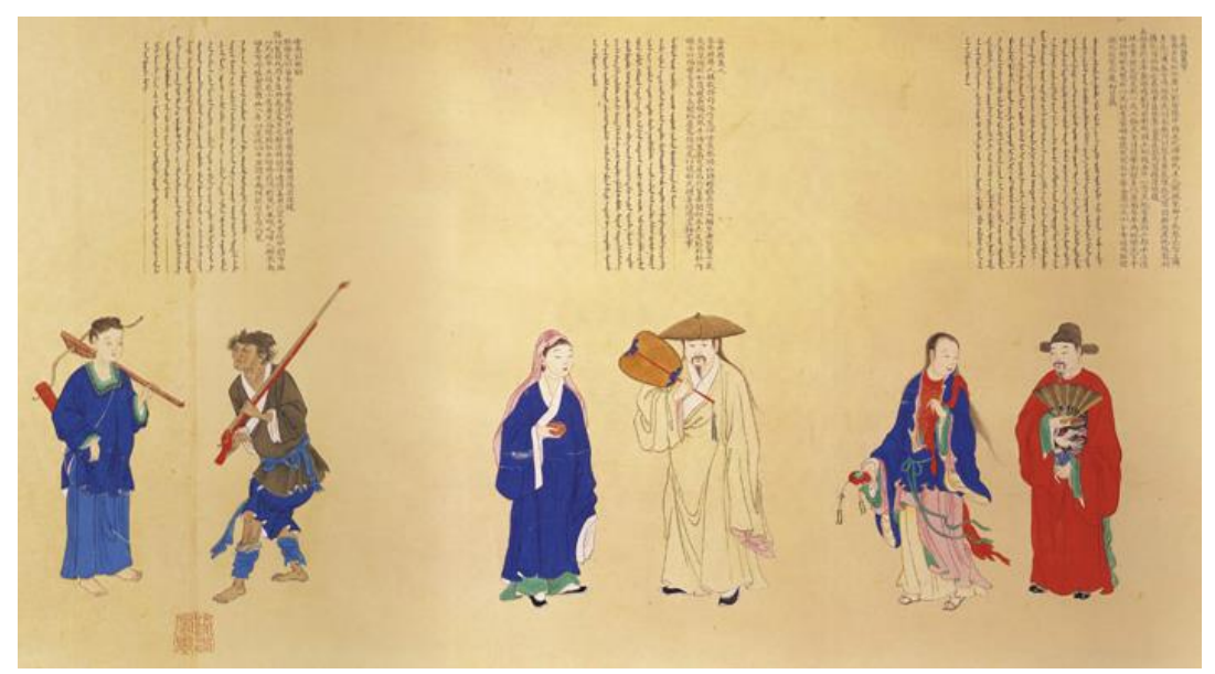
Fig. 4 Qing Imperial Illustrations of Tributary Peoples