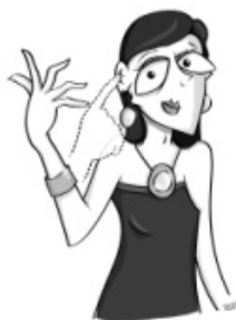
Figure 11. SER.FAMÓS ‘to be famous’

The sign SER.FAMÓS , ‘to be famous’, is a compound consisting of the aforementioned sign SENTIR.ORELLA ‘to listen.ear’ (Figure 6) and the sign TOTHOM/QUALSEVOL ‘anybody’. Semantically, it conveys a folklore evidential value. It is situated at an intermediate point in the access to information dimension, between the universal and the restricted poles (Bermúdez 2005). With regard to the subjective-intersubjective axis, it is generally used to refer to a shared piece of information between the addresser and addressee. Consider example (11) below (EES 00:23:50 ES).