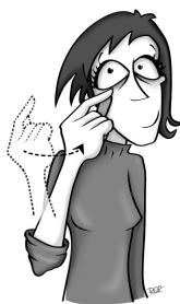
Figure 8. SENTIR_ASSABENTAR.SE.ORELLA 'to hear.find out.ear'

This construction seems equivalent to the English hearing or being told and its equivalent in Spanish ( enterarse ). Recently, a new form has emerged, from a modification of the location parameter of SENTIR.ASSABENTAR.SE.orella 'to hear.find out.ear'. The location in the ear has been replaced by a location in the eye (see Figure 8), in the same way as ESCOLTAR.ORELLA was modified (see Figure 4), giving rise to ESCOLTAR.ULL (Figure 5).