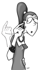
Figure 7. SENTIR_ORELLA 'to find out.ear' 'I heard/ I just heard'

speed with respect to the citation form of the predicate (see Jarque forth.b, in press). This predicate may therefore express a combination of evidential and aspectual values ('I heard' or 'I just heard').