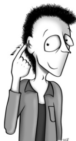
Figure 6. SENTIR.ORELLA 'to hear.ear'

A second predicated marker that expresses that the proposition content has been acquired through a perceived piece of discourse is SENTIR.ORELLA 'hear.ear', meaning 'I was told' (Figure 6). See an example of this use in (9) below (EJG 00:15:26 JMS).