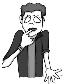
Figure 9. DIR.SE.QUE ‘to be said’

The construction DIR.SE.QUE ‘it is said that’ expresses that the access of information may be either universal or restrictive to a group. That piece of information is however not known to the receiver. Even though it formally makes reference to the spoken communication modality, semantically the construction does not include any reference to the mode of knowing. In other words, it may be spoken, signed, written down, etc. Consider example (10), in which the signer is narrating her failed attempts to stop smoking. In (10) she answers a question by the interviewer about whether she had tried acupuncture (EMS 00:16:53 MS).