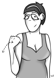
Figure 12. AVISAR-1 ‘to call/warn oneself’

In LSC, three constructions may serve to express endophoric evidence: SENTIR.AL.COR ‘to feel at the heart’, SENTIR.AL.COS ‘to feel at the body’, and I-AVISAR-I ‘to call/warn’ oneself’, a specific verbal form of that verb (Jarque forth.b). We will mainly focus on AVISAR-I ‘to call/warn’ (12).