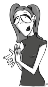
Figure 3. EXPLICAR ‘to explain’

According to Morales’ et al. typology of LSC, DIR ‘to say’ (Figure 2) is a simple verb. This means that it can only add grammatical information that is both internal to the lexical form and related to aspect (imperfective, perfective, etc.), as well as to mode or manner of information (intensity of action, faster or slower quality of movements, etc.). Consider the piece of discourse in (8), in which the signer explains how she found out that her arm was broken (EES 00:07:00 ES):