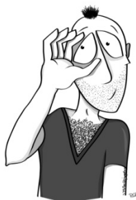
Figure 5. ESCOLTAR.ULL 'to 'listen.ey'

(listening through the auditive channel) to the location in the eye ('listen' through the visual channel') (Ferrerons). 4