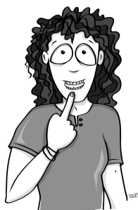
Figure 2. DIR ‘to say’

LSC direct discourse, or constructed action/dialogue, may be framed by different verba dicenda predicates, for instance AVISAR ‘to call’, DIR ‘to say’, DIR + INDEX ‘to tell’, or EXPLICAR ‘to explain’. The most common communicative verbs with an evidential functions are DIR ‘to say’ (Figure 2) and EXPLICAR ‘to explain’ (Figure 3).