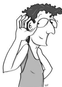
Figure 4. ESCOLTAR.ORELLA 'to listen.ear'

In LSC, the predicate ESCOLTAR.ORELLA , 'to listen.ear' (Figure 4), refers to a state of being alert while perceiving through the ear (noise, sounds, words, etc.) or paying attention to what somebody communicates linguistically (Ferrerons, 392).