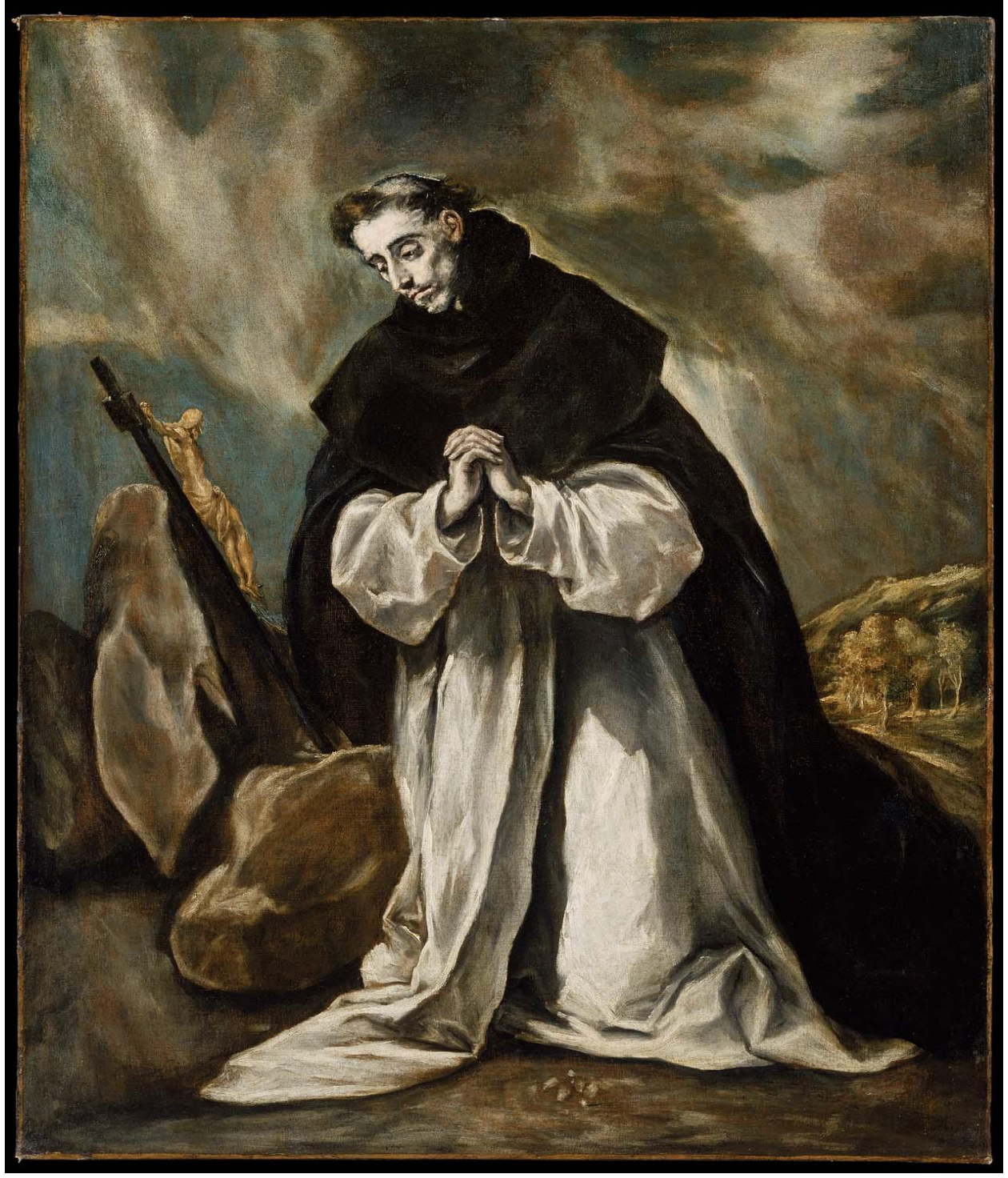
Figure 2: El Greco (Domenikos Theotokopoulos), Greek (active in Spain), 1541–1614 Saint Dominic in Prayer , about 1605 Oil on canvas 104.7 x 82.9 cm (41 1/4 x 32 5/8 in.)