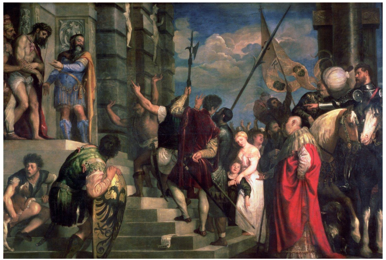
Figure 5: Titian: Ecce Homo (1543) Oil on Canvas 242 x 361 cm. Kunsthistorisches Museum, Vienna/Bridgeman Art Library